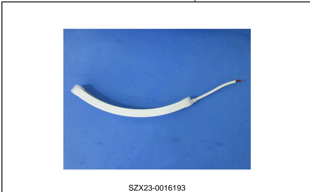
Photo of Submitted Sample

SGS authenticate the photo on original report only